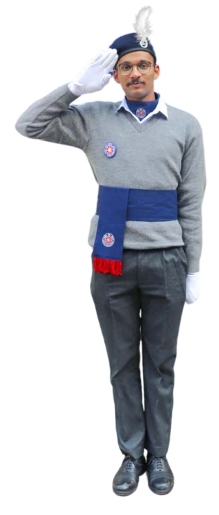
Selected for Republic Day Camp (RDC) and participated in Republic Day Parade at Rajpath, New Delhi

शाश्वतम् - NSS FIMT has a volunteer base of around 200 students belonging to various disciplines and courses at FIMT College divided into two units . Each Unit is divided in teams which are led by team head followed by volunteers.NSS volunteers work to ensure that everyone who is needy gets help to enhance their standard of living and lead a life of dignity. We work in rural areas to serve the cause of society through food donation , education, blood donation, environment & economic issues and health awareness programs. We also collaborate with several NGO's in and around Delhi on working these issues.